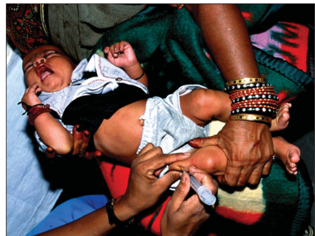
The Indian Medical Association says vaccinating babies against hepatitis B is wasteful as carrier status is often transmitted vertically